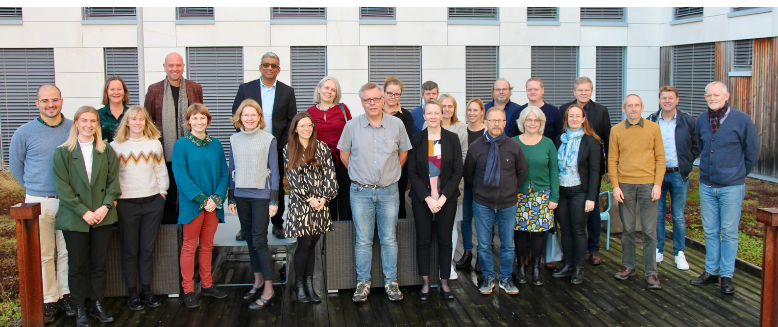
Participants on the strategy seminar 17-18. november, Scandic Bystranda Kristiansand

Better use of health data can contribute to more personal adapted healthcare services, for more learning in the healthcare service and for better communication with the population about health topics. The Center for e-health wants to contribute to user focus by building knowledge about the need for, understanding of and application of health data and health information among health personnel, patients and the general population.